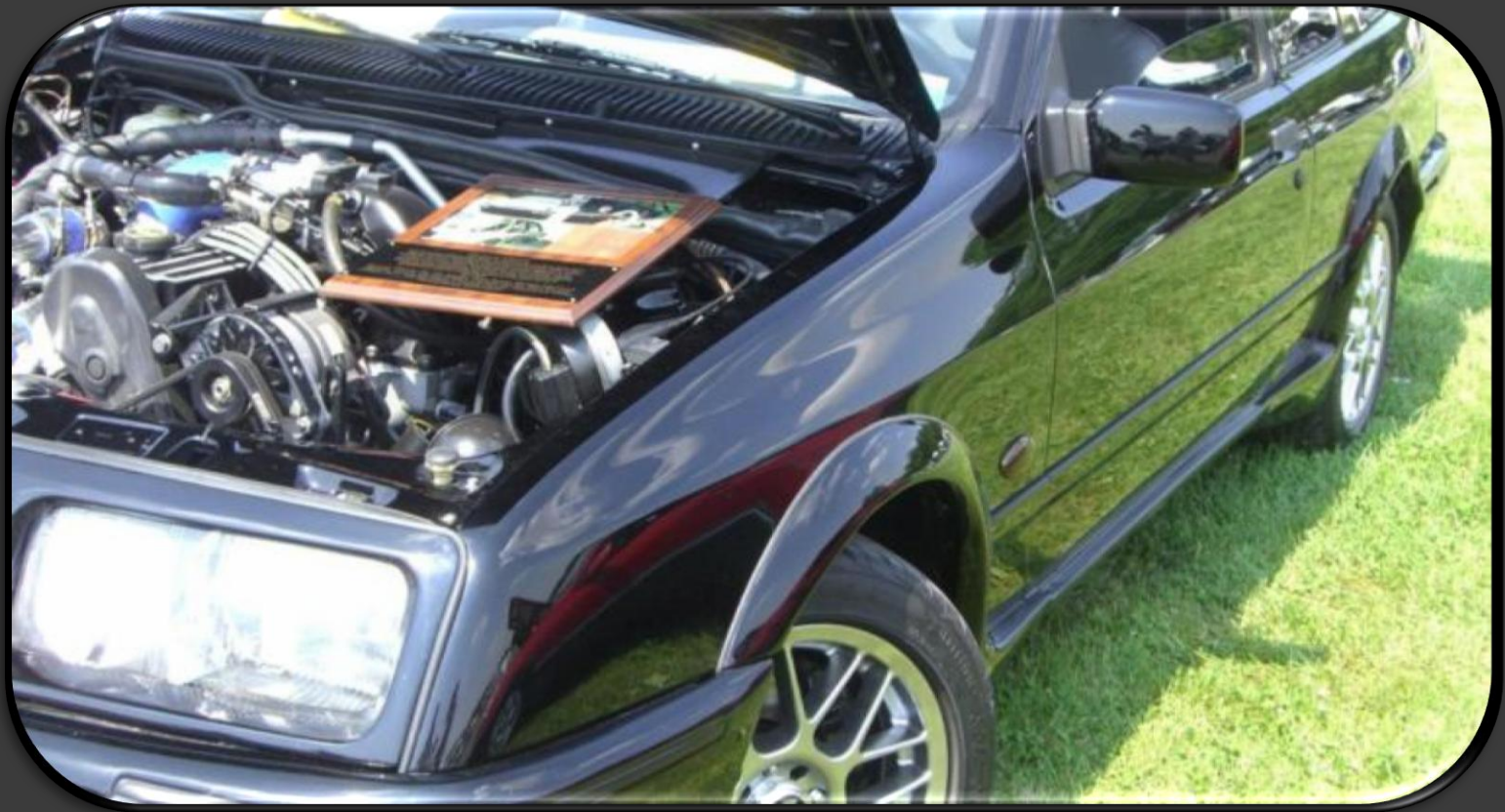
Bart Dyshuk Bloomington, NY